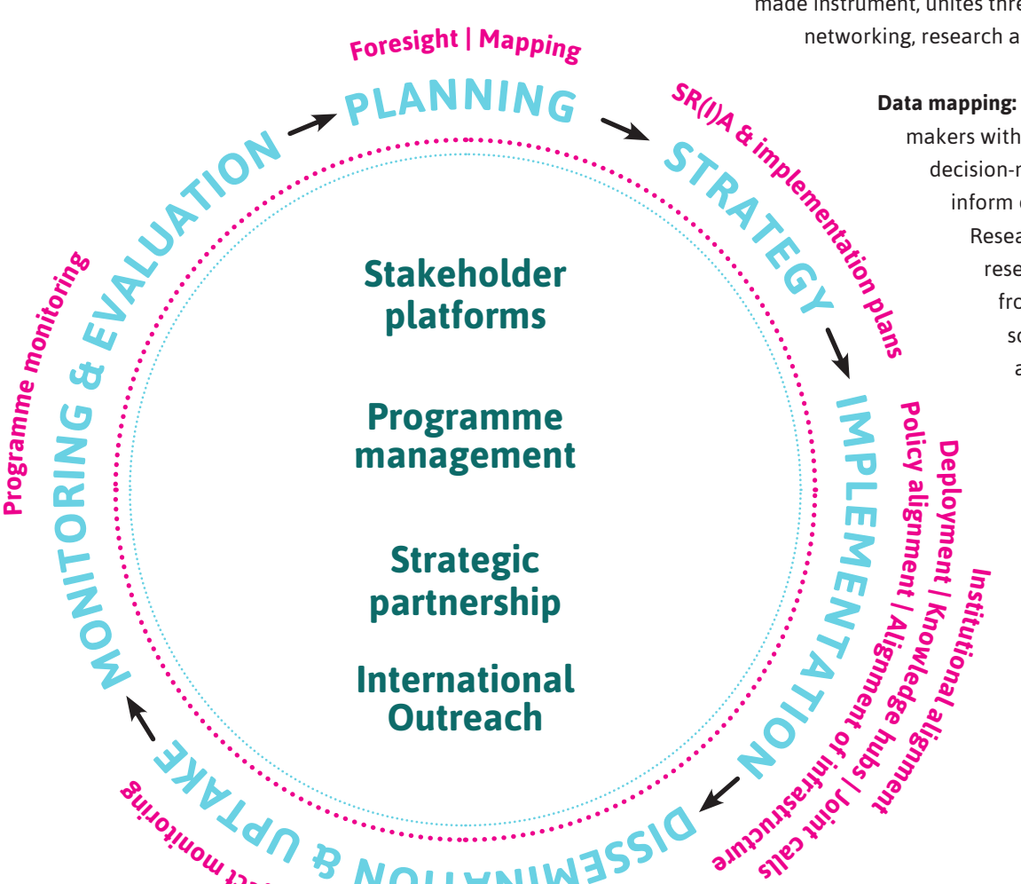
Fig 3: JPIs' portfolios of instruments along the innovation policy cycle

Foresight: Prospective exercises assist in creating joint visions and providing important frameworks for strategy development.