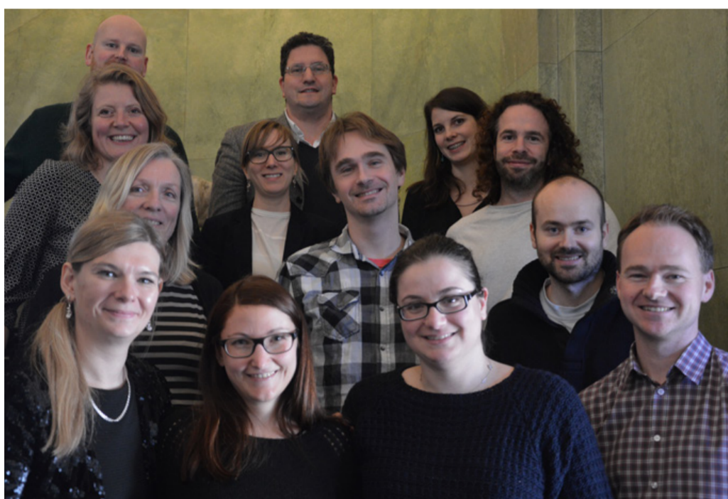
The GUST Team.

This project brings together leading European research partners and practitioners to investigate urban living labs and enhance their potential for contributing to sustainability transitions.