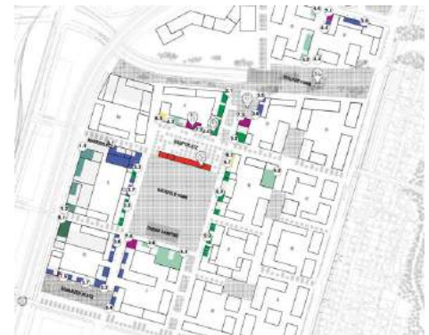
Past projects in Vienna