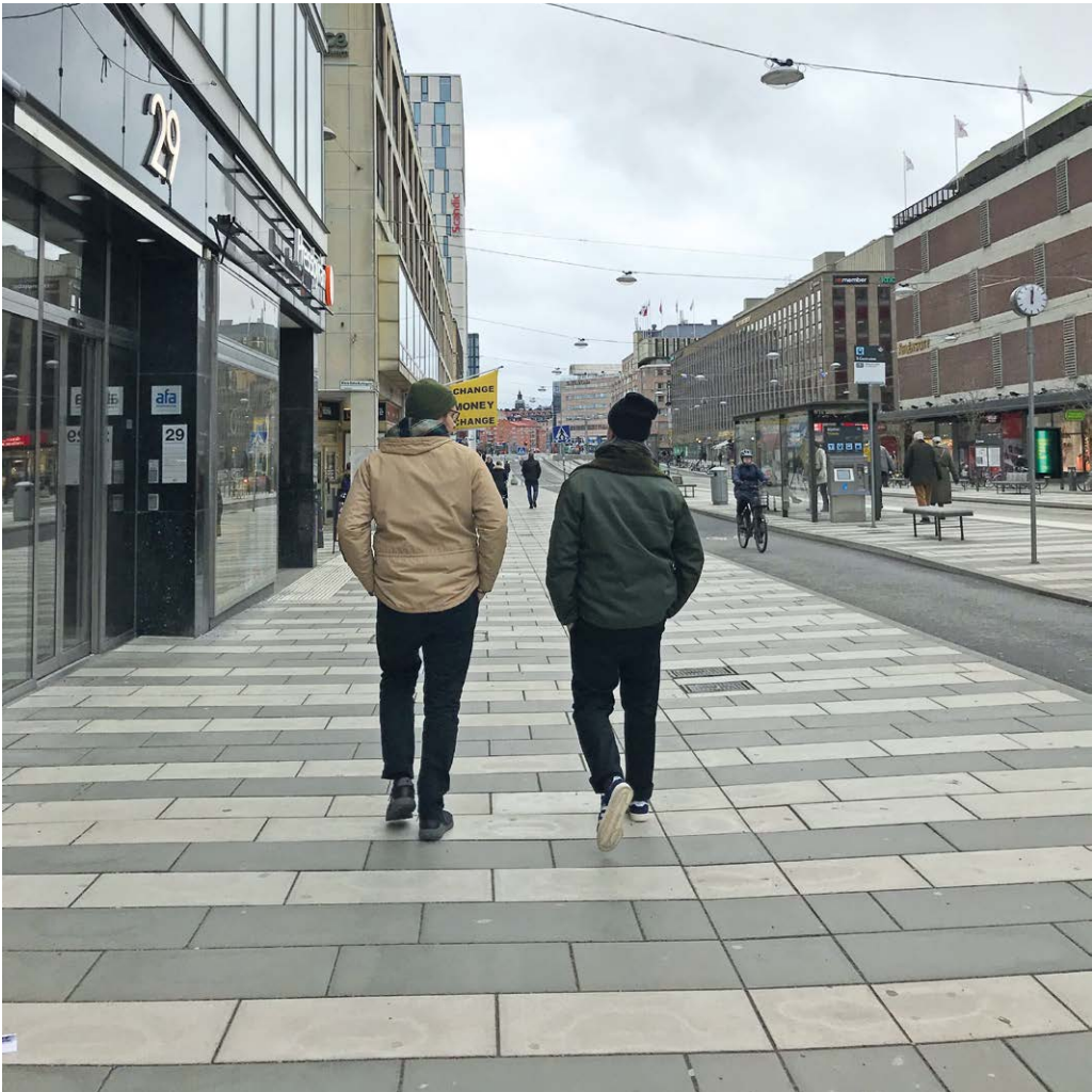
The two editors out and about in public space in Stockholm in early March, just before the big outbreak / lock down.