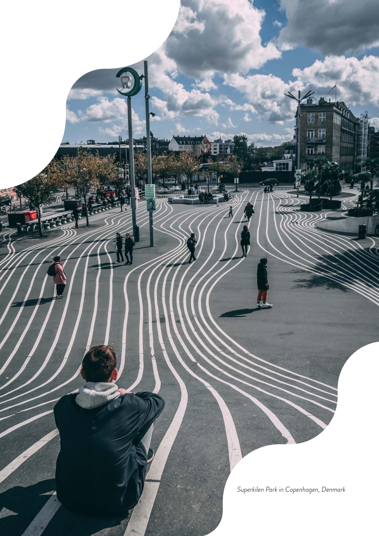
Superkilen Park in Copenhagen, Denmark