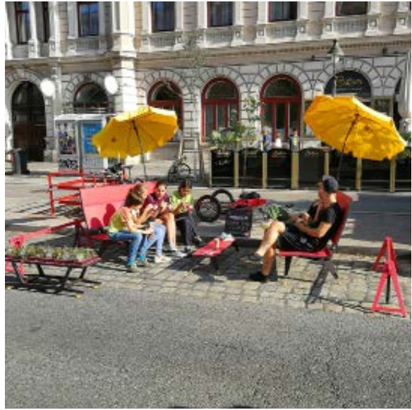
Parklet2Go: an urbanistic tool for testing, evaluating and discussing the transformation of specific (parking) spaces in an effective and informal way.

towards stationary vehicles that occupy public spaces. A straightforward policy with long-term impact is to reshuffle the land-use hierarchy (and the aligned imaginary) within streets by implementing on-street parking schemes to reduce on-street parking gradually shifting the spatial balance towards more sustainable and lively uses. This will free space to revalue streets as public spaces of wellbeing and environmental quality while at the same time accelerating a wider shift in mobility behaviour towards sustainable forms of transport.