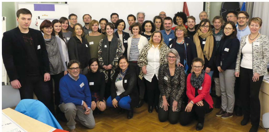
Participants of the AGORA Workshop in Riga in November 2019

below wraps up the main dilemmas and challenging urban issues discussed in AGORA session in Valencia in June 2019.