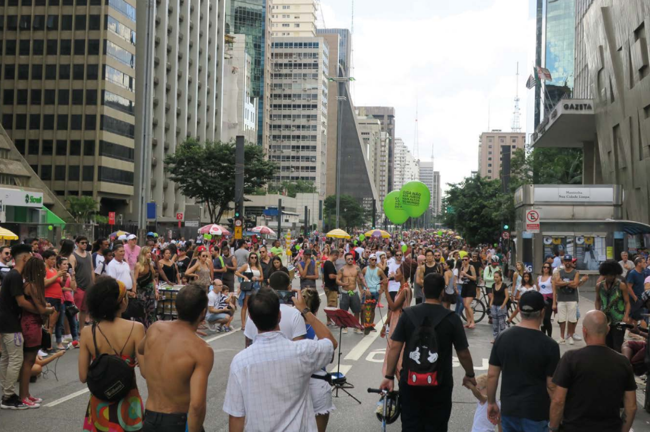
Performance during a car free Sunday on Avenida Paulista, Sao Paulo, Brazil.

mono-functional transportation strips dominated by motorized vehicles and protected in this use by societal practices and legal regulations.