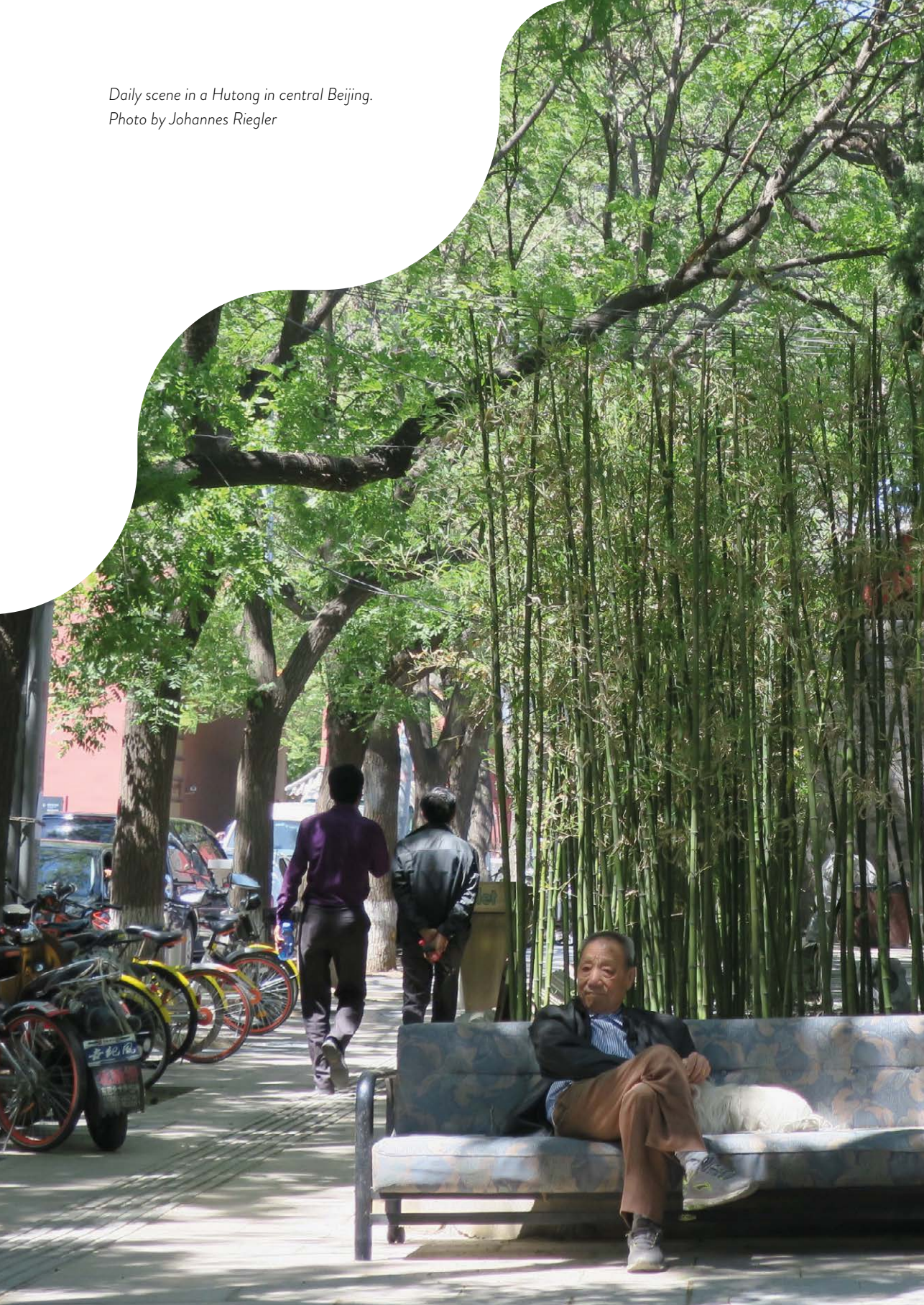
Daily scene in a Hutong in central Beijing.