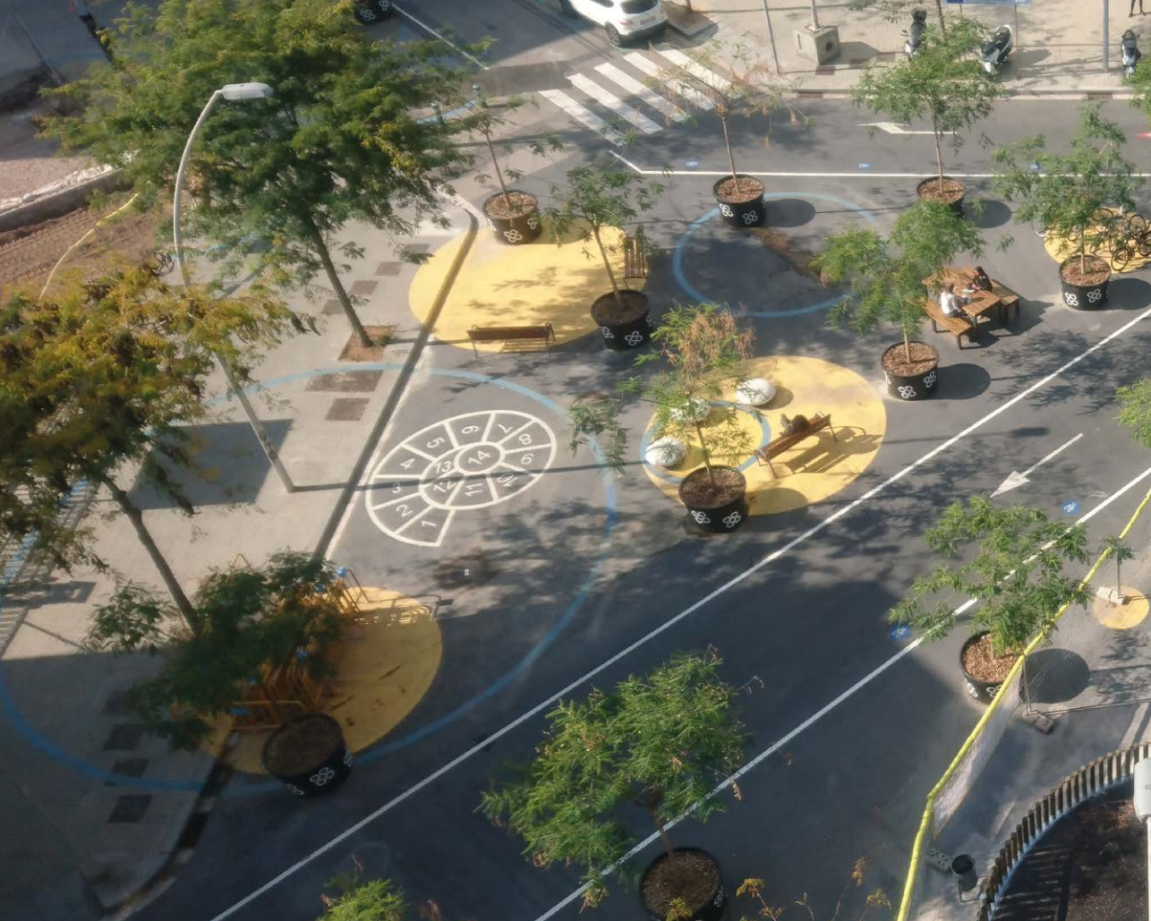
Superblock in Barcelona.

the imaginary for communicating urban transformation should be as diverse as the users' needs in regards of future urban spaces. To build this local alliance and raise the sustainability of interventions, the transformation of streets as urban public spaces should be co-created together with citizens. Various approaches for street transformation can be experimented with (Bertolini, 2020) making the potentials of urban transformation more tangible for residents.