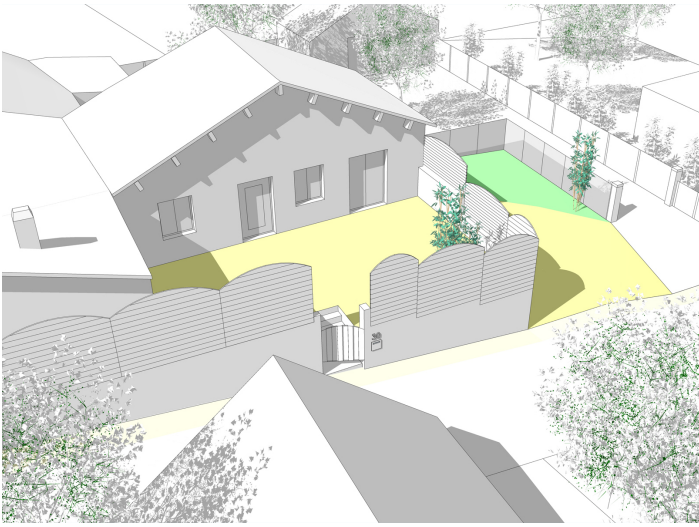
1/ Modeling of a BIMBY project: the existing