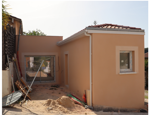
3/ Site: a rental and a terrace for the existing housing