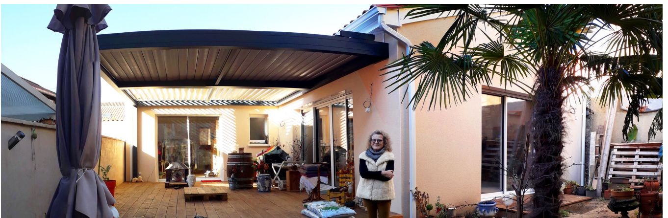
4/ A new house for my old age in the heart of the islet