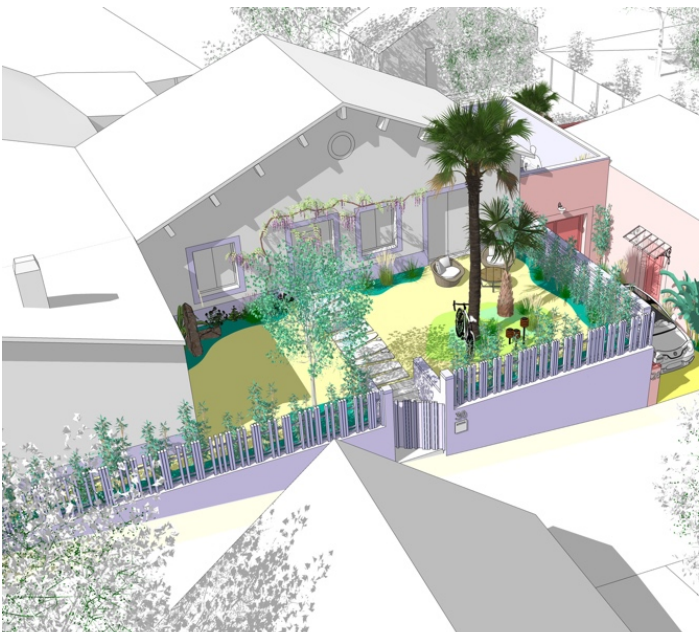
2/ Modeling of a BIMBY project: chosen scenario