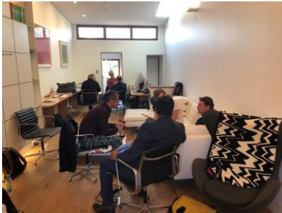
M-NEX Consortium Kick-off: Sydney [2018.05.12 – 2018.05.16]