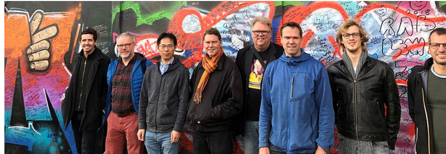
M-NEX Design Workshop: Belfast [2018-10.08-2018.10.12]