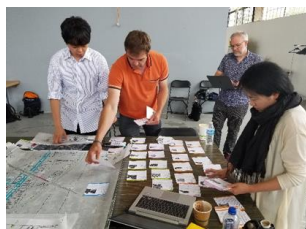
30 Jun-5 Jul '19, Detroit