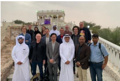
M-NEX Design Workshop: Qatar [19.02.22 – 19.02.28]