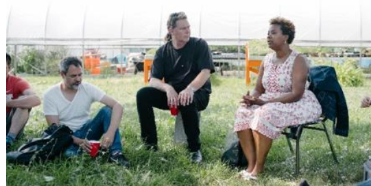
M-NEX Design Workshop: Detroit [19.06.30 – 19.07.05]