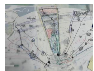
2-6 Mar '20, Groningen