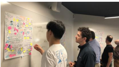
M-NEX Design Workshop: Sydney [19.11.02 – 19.11.09]

+ Active Living Lab activities with stakeholders