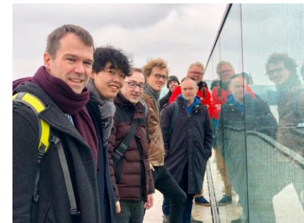
M-NEX Design Workshop: Groningen [2020.03.02 – 2020.03.06]