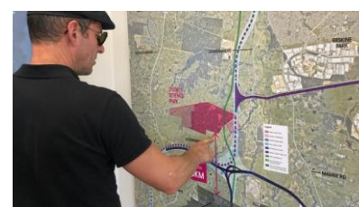
3-8 Nov '19, Sydney