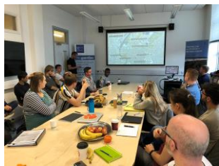
8-12 October '18, Belfast