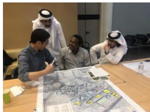
24-28 Feb '19, Doha