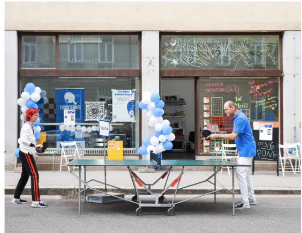
PlaceCity Project – Floridsdorf, Vienna